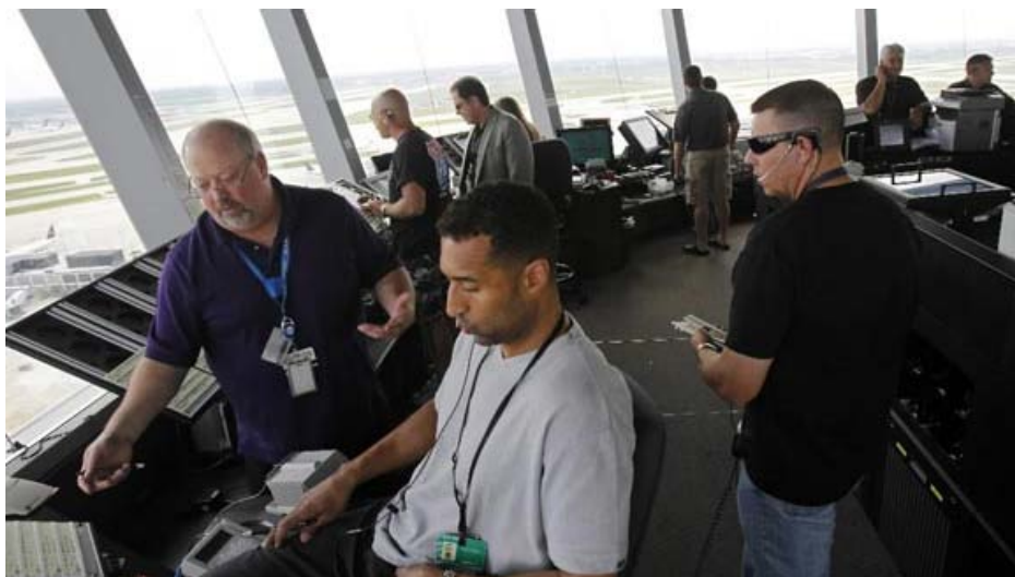
Air traffic controllers work in the control tower at O'Hare International Airport this summer.

Comments 2 Share 12 +1 0 Tweet 8 Recommend Confirm